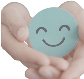
MENTAL HEALTH GROUP TELEMEDICINE