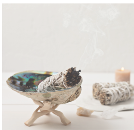
SPIRITUALITY IN CLINIC