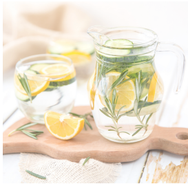
CLEANSE CLASS TELEMEDICINE